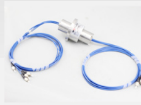
FB04 series Slip Rings

FB04 slip rings are standard, off-the-shelf. It could support 4 channel fiber optics(SM/MM) transmitting on 360° rotating.Single-channel (SM or MM) rotary joints(FORJ) are the most versatile designs the market has ever seen. The rugged body allows fiber pigtail, ST, or FC receptacles on either the rotor side or the stator side. One can configure the package to fit his need exactly. features extremely low insertion loss and impressive return loss performance for both singlemode and multimode fibers.